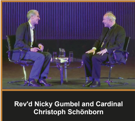
Rev'd Nicky Gumbel and Cardinal Christoph Schönborn

In his opening address at this May's conference, the senior leader and Anglican Vicar, Rev'd Nicky Gumbel, disclosed that 2012 had been a year in which he discovered the extent of his own Jewish heritage and the painful past that it carried, with many members he had never known lost in the Shoah. His family had been researched by a museum in Berlin and he had been linked to Jewish relatives he had never known, or known about. All this was by way of a sermon illustration, but it did set a scene for what was to follow.